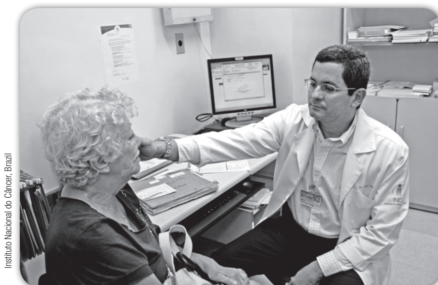
Instituto Nacional do Câncer, Brazil