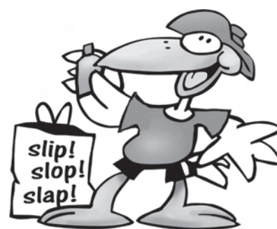
Sid the Seagull, the character used for the first "Slip, slop, slap" campaigns in the 1980s in Australia.

According to the Instituto Nacional do Câncer (National Cancer Institute), skin cancer continues to be the most common type of cancer for both men and women in Brazil. According to