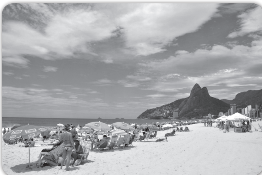
Ipanema Beach, Rio de Janeiro, Brazil. January 2009.