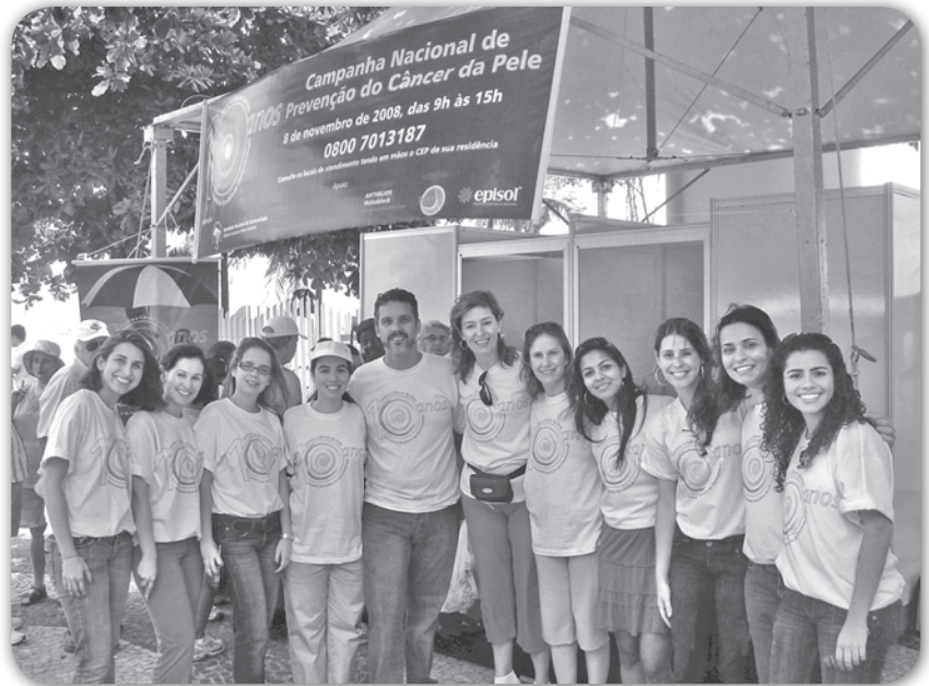
The National Campaign to Prevent Skin Cancer mobilizes Brazilians to attend one of thousands of mobile clinics on a single day every November.

Gladstone says the best campaigns are in Australia, the country with the world’s highest incidence of melanoma. Public education for skin cancer prevention began there in the state of Victoria in the 1980s with community service announcements on television featuring an animated character Sid the Seagull promoting the message “Slip